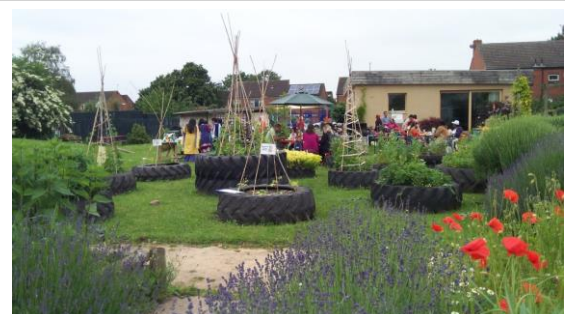
Arkwright Meadows Community Gardens

Please ensure you are logged onto Showbie to receive ongoing messages.