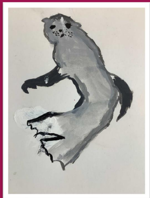
Art work inspired by David Attenborough: