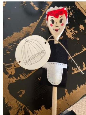
A thaumatrope and a wooden spoon dolly.