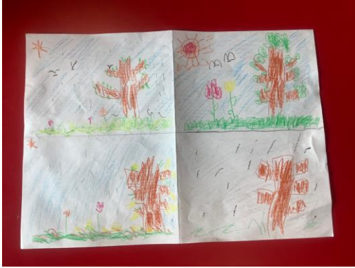
Lukas's picture depicting the seasons

Hello everyone, We hope you all had a wonderful break. We are really enjoying watching all your 'show and tells' about the seasons - the class has learnt some valuable information from them already. For example, we have learnt what happens in different seasons, how to dress for the weather and even how the hours of daylight change.